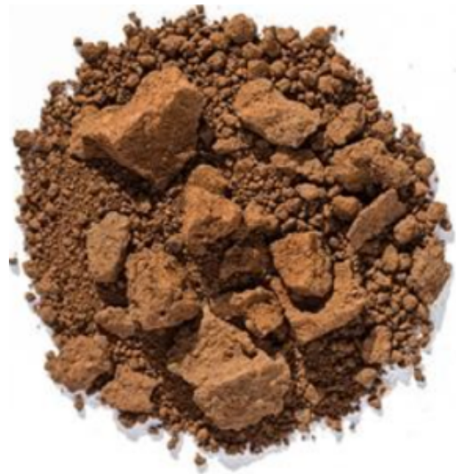
JORY SOIL VOLCANIC CLAY

Willakenzie Soil is the soil type of our Kalita Vineyard located in the Yamhill-Carlton AVA – Redolent in black fruits (blackberry, black currant, black cherry), tinged with blue fruits (blueberry, boysenberry) and light floral tones (lilac, gardenia), light earthiness (dry sandy soil) with balanced acidity, soft tannins and silky textural notes. There is a roundness and depth to the wines from this vineyard and AVA.