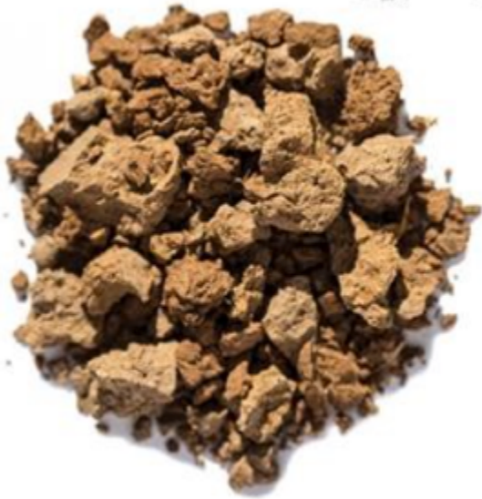
WILLAKENZIE SOIL SEDIMENTARY MARINE

The mustard-tinted Willakenzie is the best-known sedimentary soil in the Willamette Valley. Western Oregon was on the floor of the Pacific Ocean. About 15 million years ago, the Pacific and North American tectonic plates collided, lifting up this ocean floor and creating the Coast Range and the Cascade Mountains. Willakenzie soil is composed of the marine sediment of that former seafloor combined with the alluvial scree from the Lake Missoula flooding. As the collisions continued, the hills of the Willamette Valley were formed, with the top layer of volcanic soil exposed in some places and the lower layer of sedimentary soil revealed in others.